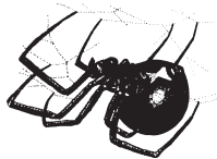
black widow spider

When removing spiders, don't overlook the fact that spiders eat a large number and variety of nuisance and pest insects. Spiders also have natural enemies — wasps, other spiders, birds, reptiles, and others — that sometimes keep them from becoming too numerous.