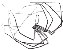
longbodied cellar spider